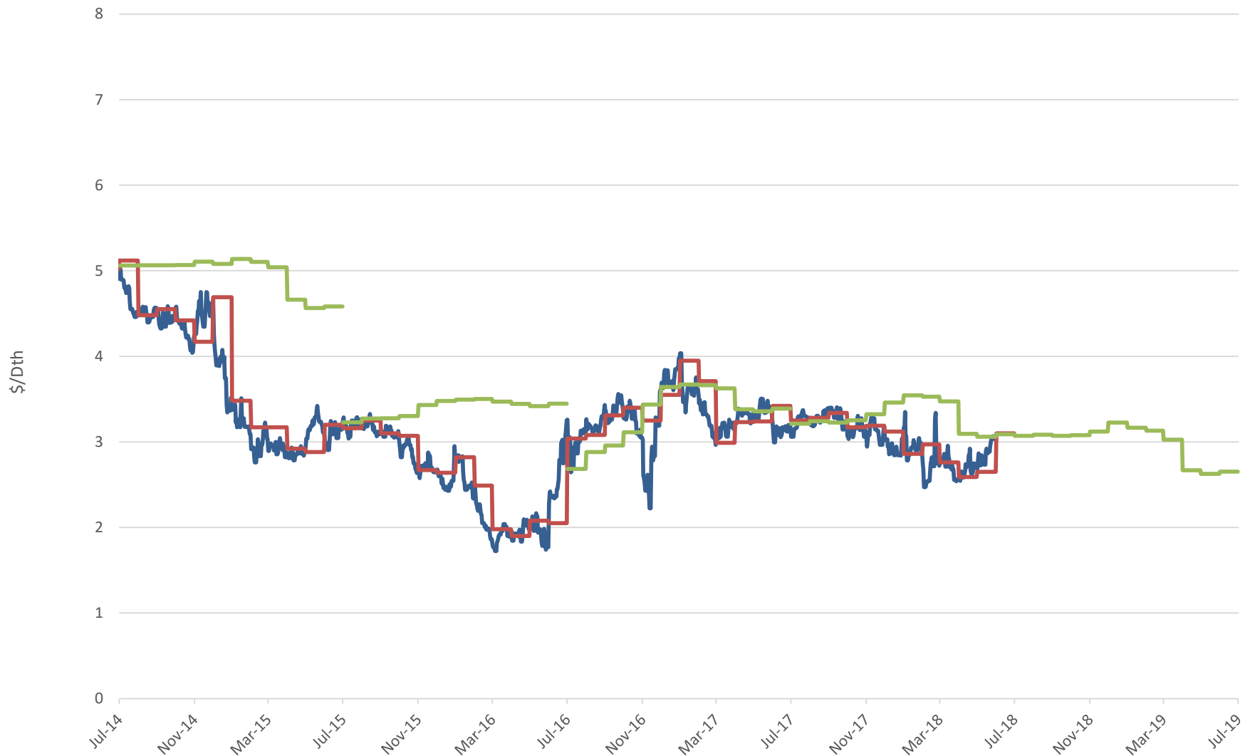
5-Yr Historical/Future Market Price Indices @ PG&E Citygate