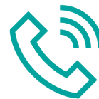
Telephone Town Halls