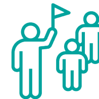
Host Walking Tours