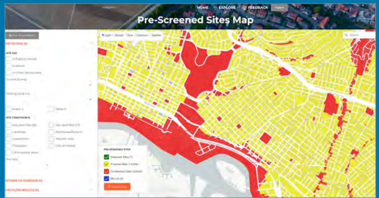
ABAG’s HESS tool facilitates housing site selection

HCD’s new reporting form. The tool is being further enhanced this year with data related to promoting fair housing policies.