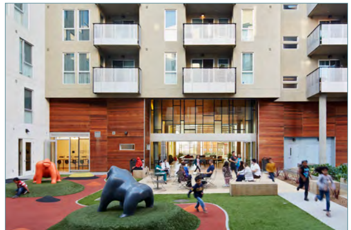
Station Center Apartments, Union City

ABAG recently approved an innovative Regional "Consulting Bench" of experts to augment local staff. All Bay Area cities, towns and counties can use the bench to hire consultants directly, or opt to have ABAG administer contracts on their behalf. A labor-saving online tool from City Innovate allows jurisdictions to receive bids, and then easily compare consultants' rates and qualifications. The bench will free local staff time from the tedium of contract administration to prioritize community engagement, policy development and rezoning.