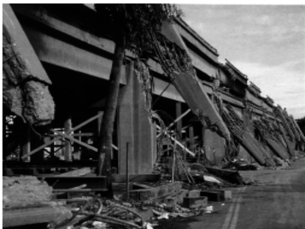
The parts of the Cypress Street freeway (I-880) structure that collapsed in Oakland are located in a region where seismic shaking was expected to be greater than to the south, where the elevated freeway did not collapse.

Over 50 earthquake experts and professionals will be participating in ABAG's Fall General Assembly, Living on Shaky Ground - Lessons of Loma Prieta , on October 14 and 15, 1999 , in Oakland .