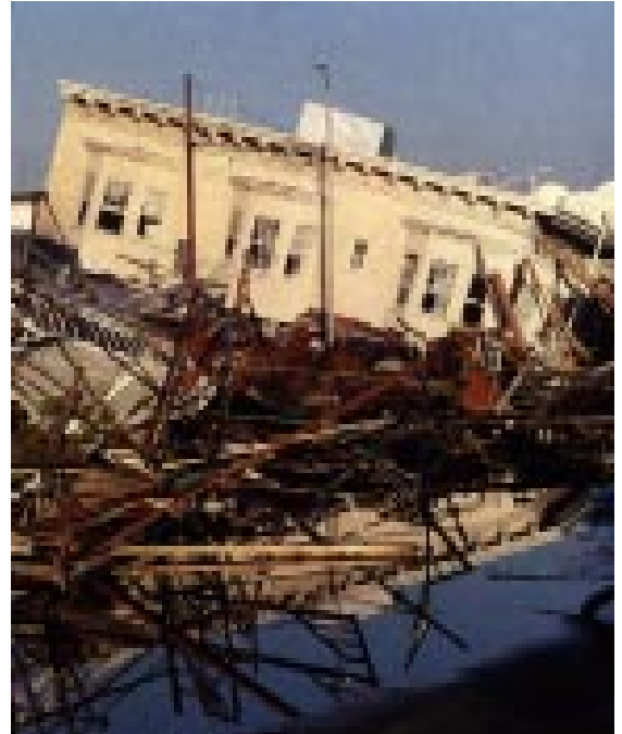
Damage to the Marina District of San Francisco caused by the October 17, 1989, earthquake.

Ten years later, the Bay Bridge is back in action but is scheduled for a seismically-safe replacement; new connections at "The Maze"