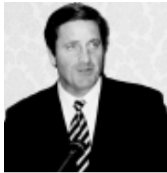
John Garamendi, State of California Insurance Commissioner

“Natural disasters can and do strike anywhere. It makes sense to find a more efficient, effective solution under an insurance policy that would spread the risk and share the cost of rebuilding after these devastating forces of nature,” he said.