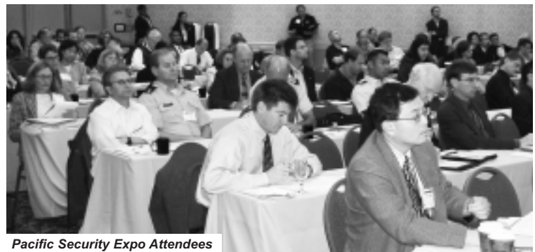
Pacific Security Expo Attendees

For complete information on ABAG’s Local Hazard Mitigation Planning Effort, including interactive hazard mapping and risk assessment, go to http://quake.abag.ca.gov/mitigation .