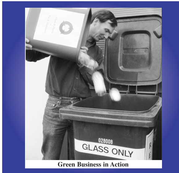
Green Business in Action

the Association of Bay Area Governments in partnership with local, regional, state and federal agencies and industry representatives, the Program assists and recognizes businesses that voluntarily go beyond compliance to prevent pollution, conserve energy and water, and minimize solid and hazardous waste. Launched in 1996 with a focus on small and medium-sized businesses, the Program initially certified auto repair shops in two counties. Now offered in Alameda, Contra Costa, Marin, Napa, Santa Clara, and Sonoma counties, the Program has certified businesses in 17 industries. Eighteen public agencies have also been certified, including fleet maintenance, reprographic, and corporation yard operations. Recently the City of Palo Alto became the first jurisdiction to achieve citywide certification and Marin County has certified its Civic Center.