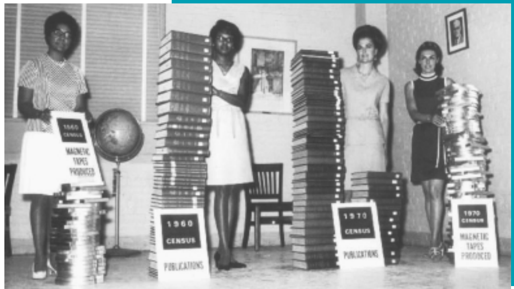
Historical photo

workshops and others to be scheduled in coming months please e-mail workshop@mtc.ca.gov .