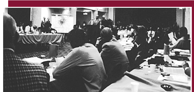
ABAG’s Executive Board debates the proposed development of the Las Positas development in 1975.