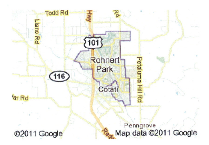
Exhibit A - Jurisdiction Boundary Map