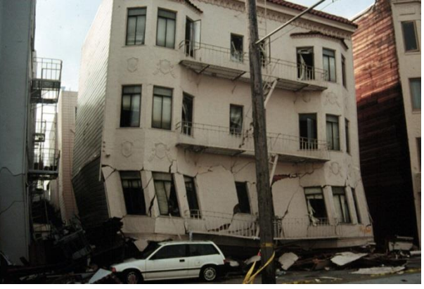
1B. Collapsed 4-story building, San Francisco, Loma Prieta earthquake