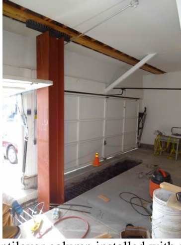
2D. Cantilever column installed with new concrete footing (awaiting concrete)