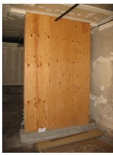
2B. New stand-alone wood shear wall with new concrete footing