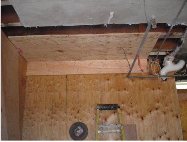
2E. Local strengthening of the second floor diaphragm