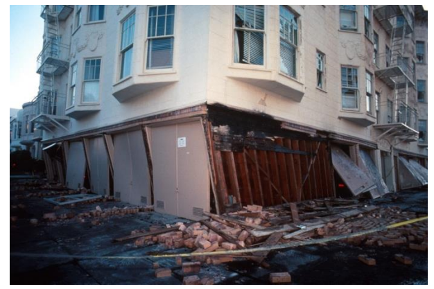
1A. Near-collapse, San Francisco, Loma Prieta earthquake