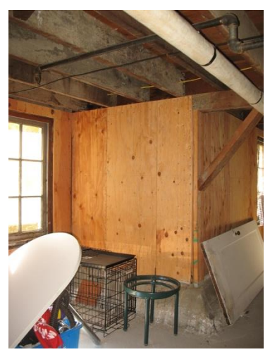
2A. Wood sheathing applied over existing studs, using the existing concrete foundation