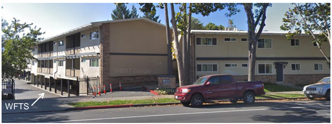
Different buildings on same parcel. Left: 3-story, WFTS, parking below grade. Right: 2-story, No WFTS