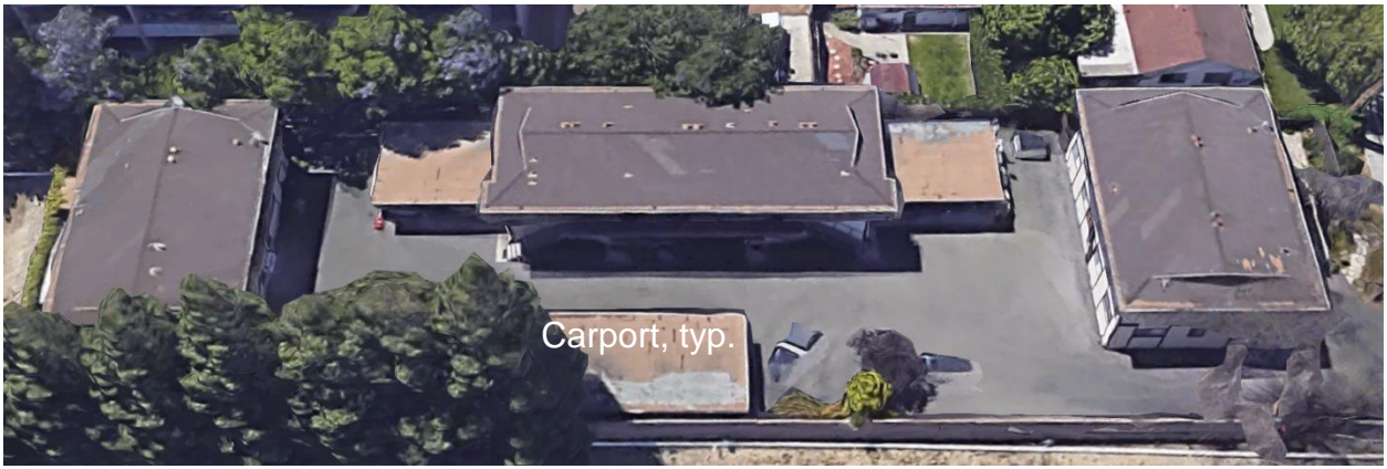
Three 2-story buildings (13 units total). No WFTS; parking provided under adjacent carports.

Front house (1 unit), with rear 5-unit 2-story building. Rear building presents WFTS condition.