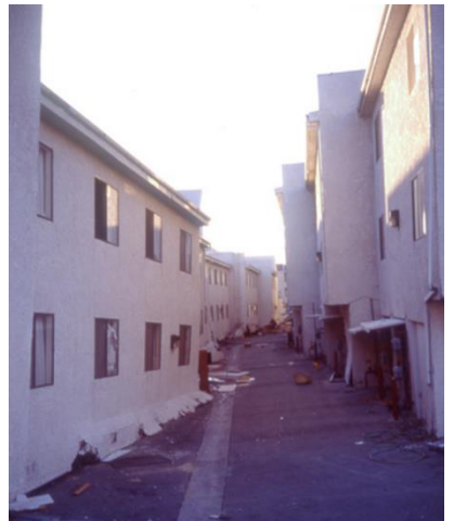
1B. Left: Collapsed 3-story building. Right: Sidesway damage, Los Angeles, Northridge earthquake