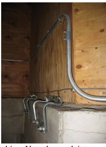
2F. Sill bolting. Note the conduit temporarily removed and reinstalled.