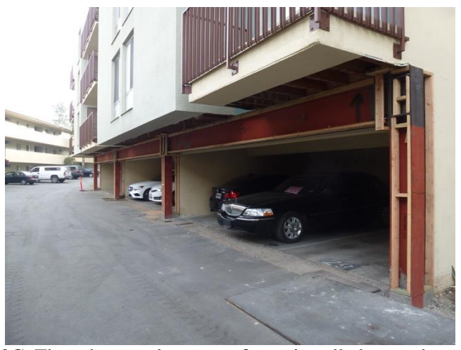
2C. Three-bay steel moment frame installed around garage door openings, with new concrete footing