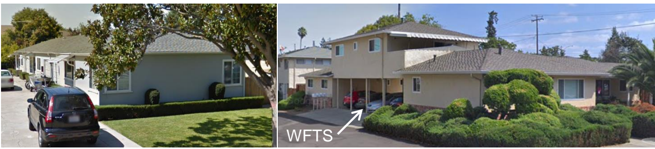
3-unit buildings. Left: 1-story, no WFTS. Right: WFTS, "House Over Garage" type.