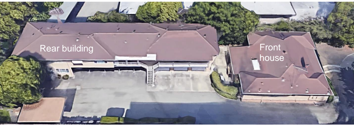
Figure 1. Typical buildings: Multi-building parcels

Front house (1 unit), with rear 5-unit 2-story building. Rear building presents WFTS condition.