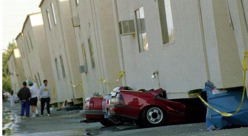
1D. Collapsed 3-story building, Los Angeles, Northridge earthquake

A collapsed soft story building adjacent to a public way also threatens public safety and blocks sidewalks and streets. Where soft story buildings comprise a large portion of a city's housing stock, the aggregate effect of their poor performance can exceed emergency shelter capacity, exacerbate housing shortages, and delay recovery citywide.